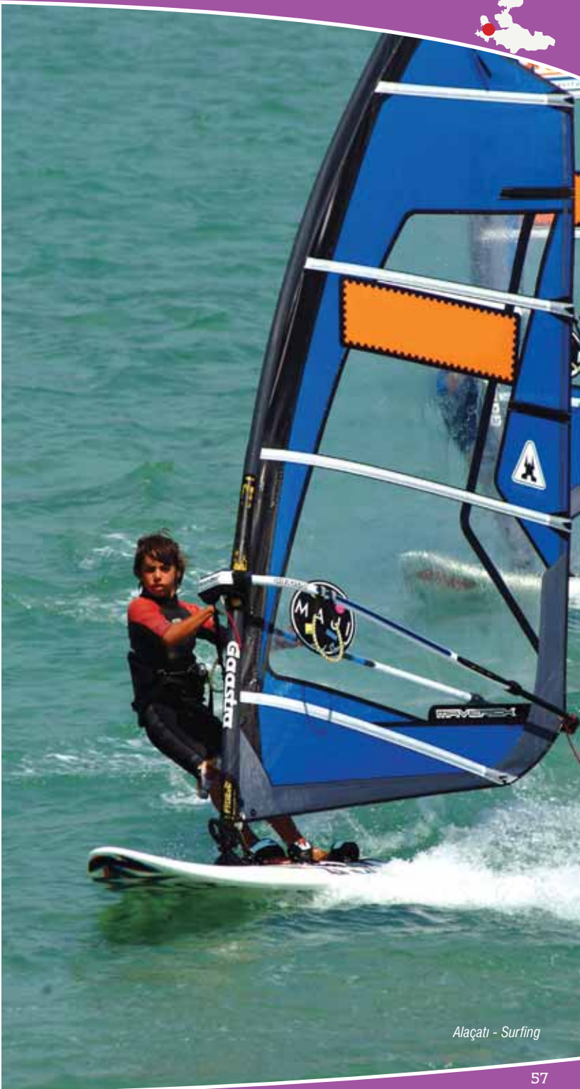
Alaçati - Surfing