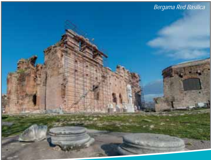
Bergama Red Basilica

Kozak Plateau, located 20 km. from Bergama is accessible via the road running between Bergama and Ayvalık. It is a sight particularly recommended for hiking enthusiasts, and people with in interest in the local woven products.