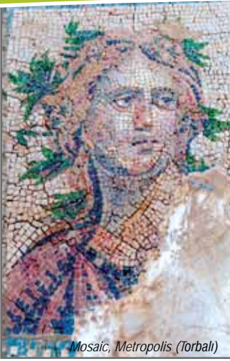
Mosaic, Metropolis (Torbali)

earthenware. Research on the cult cave belonging to the Mother Goddess, which gave her name to the city, as well as the excavation work in the metropolis is currently in process. The finds and fortune telling lists discovered in the cave indicate that the Mother Goddess Cave was used as a centre of soothsaying.