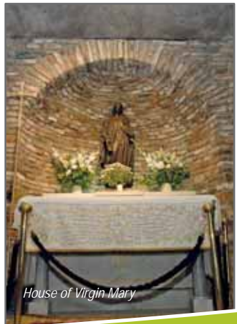
House of Virgin Mary

This hill was defended by a castle that was constantly fortified throughout the Early Christian, Byzantine and Seljuk Periods.