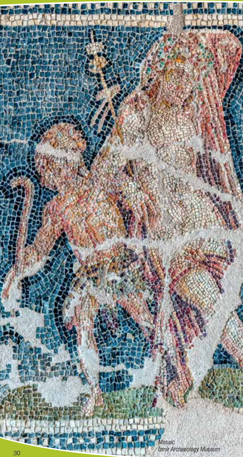
Mosaic İzmir Archaeology Museum