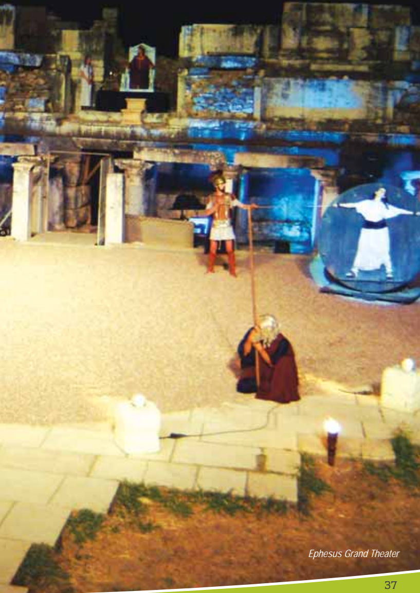
Ephesus Grand Theater