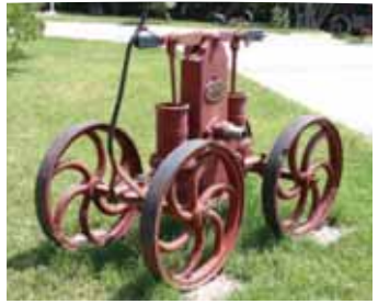
Çamlık Steam Locomotives Outdoor Museum

types of copperware and beads produced to avert the evil eye (göz boncuğu). Visitors can also see a 16th century Ottoman Bath, which has been recently restored.