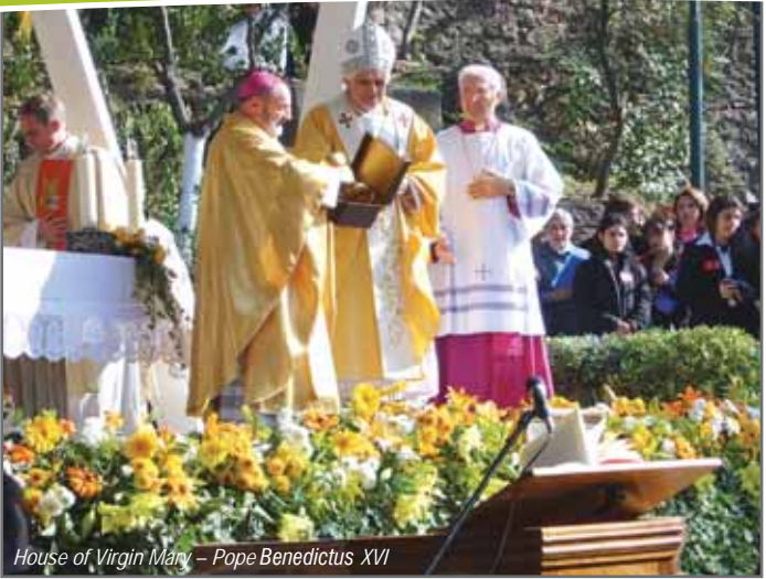
House of Virgin Mary – Pope Benedictus XVI

The outer wall, which still stands today, was built in the Early Christian Period, and underwent major restoration in the Seljuk and Ottoman periods.