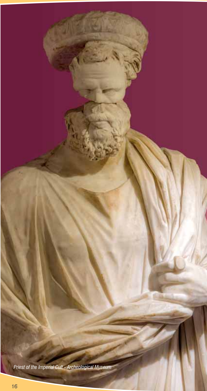
Priest of the Imperial Cult - Archeological Museum