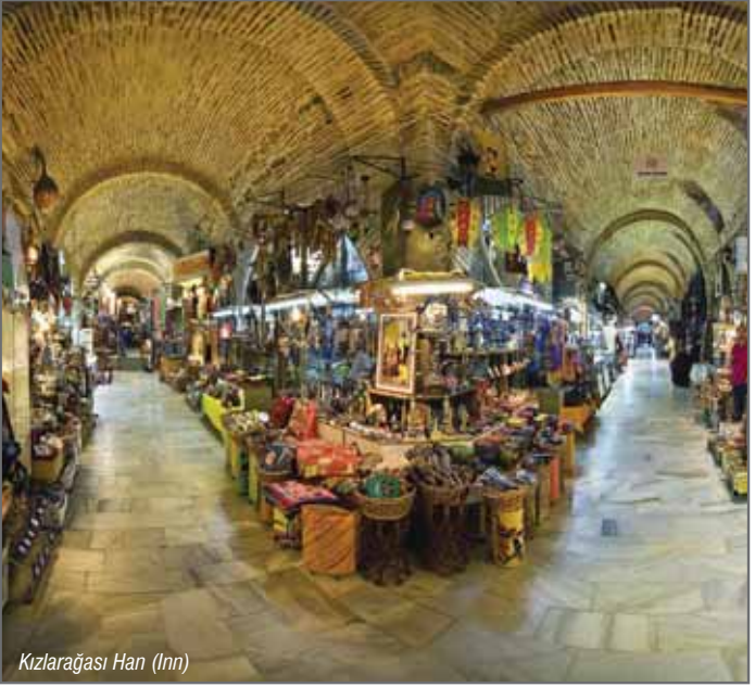
Kızlarağası Han (Inn)

stylish stores, parades, running and biking courses. It also provides an ideal atmosphere for entertainment and recreational activities, bringing together the people of İzmir.