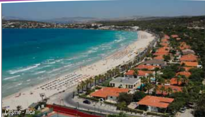
Çeşme - Ilica