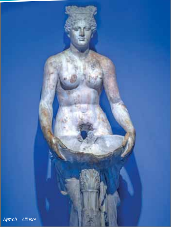
Nymph – Allianoï

The centre was used without interruption until the 11th century. The Roman Bridge and Bath located in this area have survived to the present day.