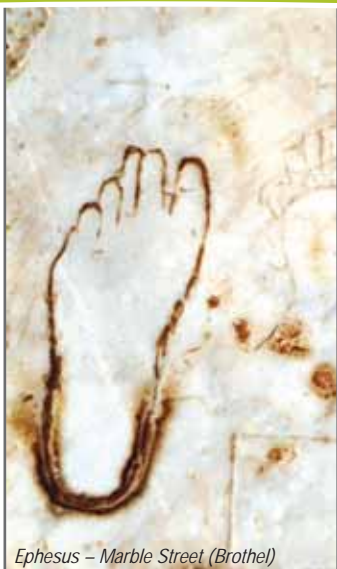
Ephesus – Marble Street (Brothel)

from that time. The four female statues situated among the front façade columns depict Celsus' personal virtues – Wisdom (Sophia), Character (Arete), Judgment Power (Ennoia) and Experience (Episteme).