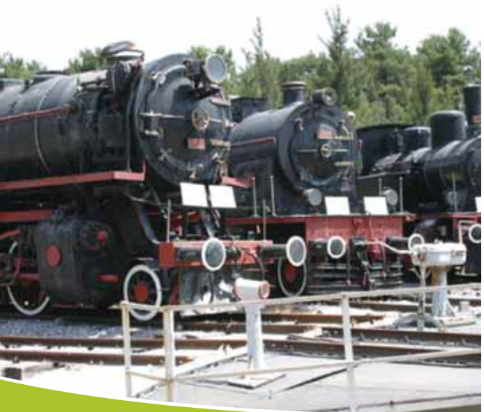
Çamlık Steam Locomotives Outdoor Museum

It is situated over an area of 160,000 square meters, 7 km. from Selçuk and can be reached by rail or road. During the Aegean military manoeuvres, Atatürk, the founder and first president of the Republic of Turkey, set up his headquarters at this station. He arrived at the station on his white train, and with access so readily available to the Aegean coastline was able to follow and direct the manoeuvres. The museum exhibits 25 steam locomotives, aged between 50 and 80 years.