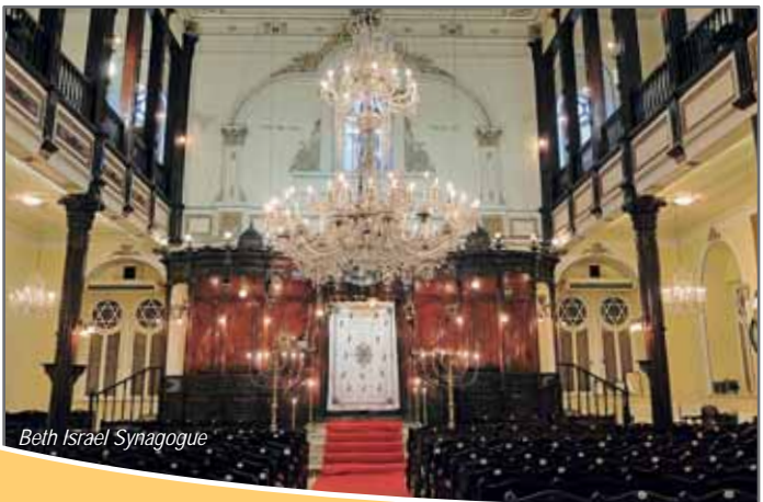
Beth Israel Synagogue

Construction began in 1862 and services started in 1874. The main altar was a gift from Pope Pius IX. It is known that in 1863, Sultan Abdülaziz, the then Ottoman ruler, donated a large sum of gold for financing the construction of this church. Both Protestant and Catholic American communities presently use the church.