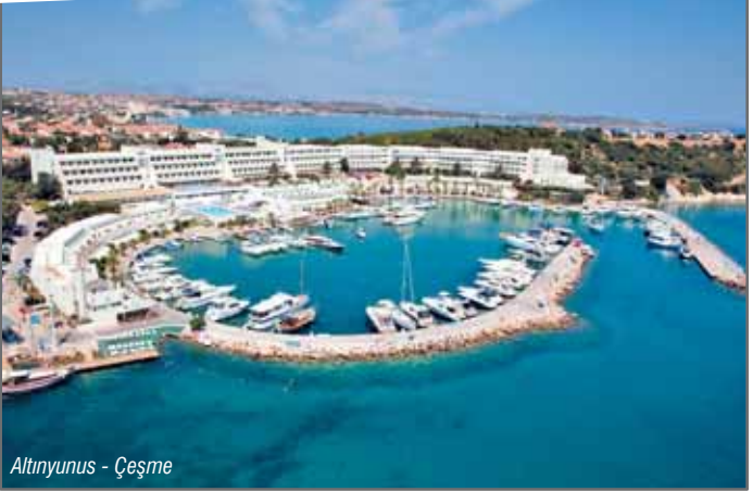
Altinyunus - Çeşme

as the use of a beach. The most popular beaches in the province include beaches at Pamucak, Urla, Gülbahçe, Çeşme, Ilica, Alaçatı, Altinkum, Gümüldür and Özdere, as well as those at Dikili, Çandırılı, Foça and Ören in the north. Transport to and from the beaches is very convenient. Throughout the day there is transport from the bus stations at İzmir central and Üçkuyular to almost every district.