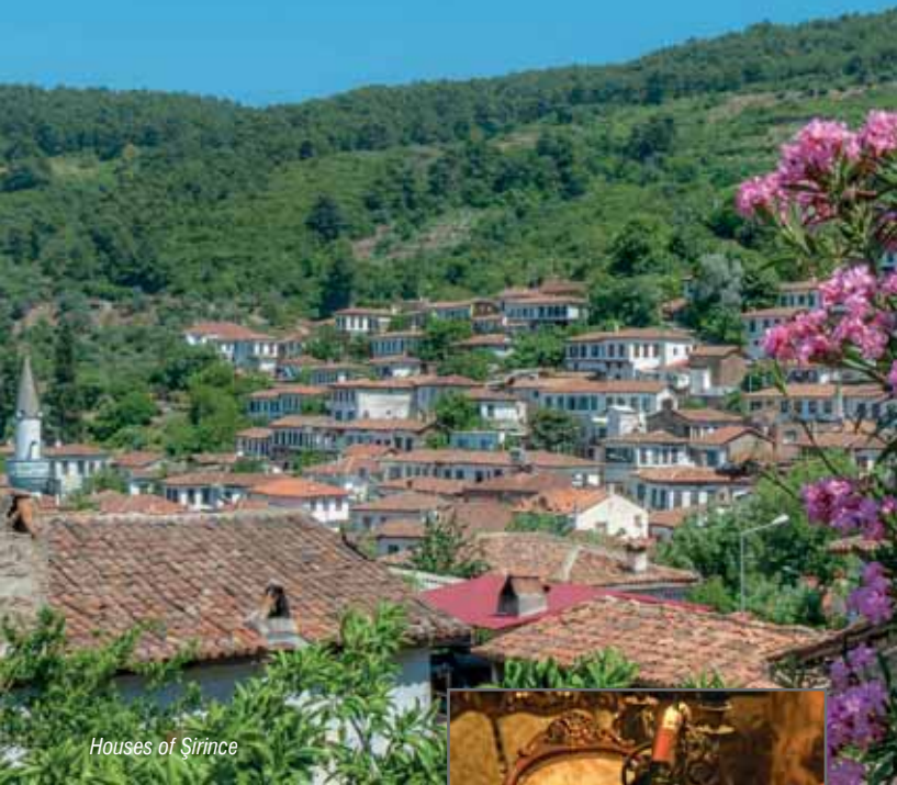
Houses of Şirince