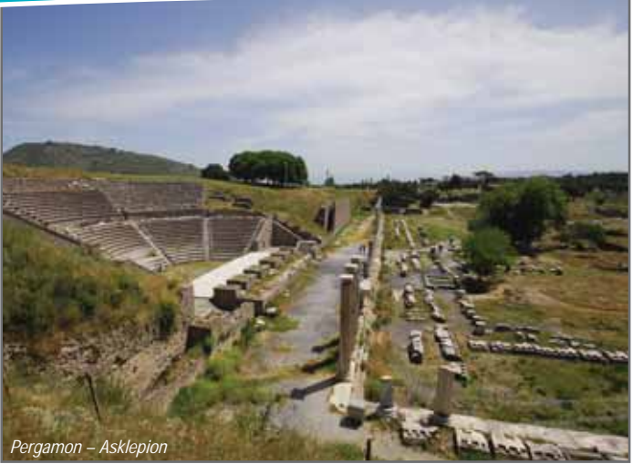
Pergamon – Asklepiion

Bithynia looted Asclepiion, taking with him to his country all the valuable statues and works of art. This included the Statue of Asclepius.