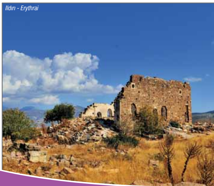
Ildırı - Erythrai

At present, Ildırı is a small secluded seaside town which is particularly noted for its fish restaurants and spectacular sunsets.