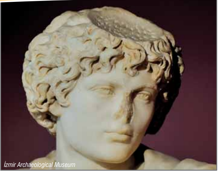
İzmir Archaeological Museum

periods to the Byzantine Period. İzmir Archaeological Museum, where artifacts unearthed at the ruins such as Aphrodisias, Bayraklı, Bergama (Pergamon), Bodrum, Çandırılı, Efes (Ephesus), Erythria, İassos, Claros, Klazomenia, Colophon, Kyme, Larissa, Lebedos, Magnesia, Miletus, Notion, Phocaea, Stratonikeia, Teos and Tralles are exhibited, is home to baked earth remains found, dating back to prehistoric ages and the third millennium BC.