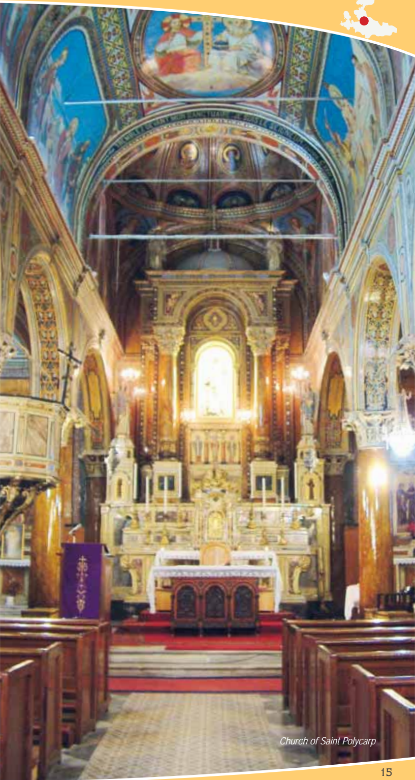
Church of Saint Polycarp