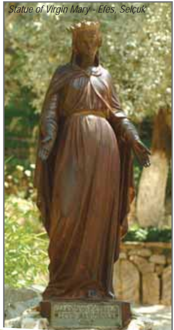
Statue of Virgin Mary - Efes, Selçuk

Ephesus is also home to the largest temple from the Artemis cult, based on the tradition of Kybele, the most ancient goddess in Anatolia. The Temple of Artemis in Ephesus was one of the Seven Wonders of the Ancient World in the Classical Period. The port city of Ephesus where people immigrated by sea and began settling in 1050 B.C. was re-located to the environs of the Temple of Artemis in 560 B.C.