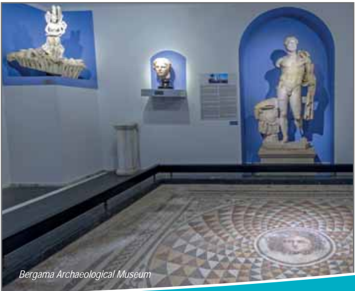
Bergama Archeological Museum

A princess amongst spas Allianoi Health Centre was built 18km northeast of Bergama, whereby the thermal waters were made available to the locality. Excavation work under way at an ancient settlement on the bed of Yortanlı Dam aims at rescuing archaeological artefacts. These important excavations, and especially the discovery of the invaluable "Statue of Nimphe", have contributed significantly towards a greater understanding of the city. It is believed that hydrotherapy was widely practiced in Allianoi, considered one of the leading health care centres in the ancient Aegean basin. Allianoi, was a small health care centre in the 2nd century B.C. In the 2nd century under the reign of the Roman Emperor Hadrian it prospered into a splendid settlement and health care centre.