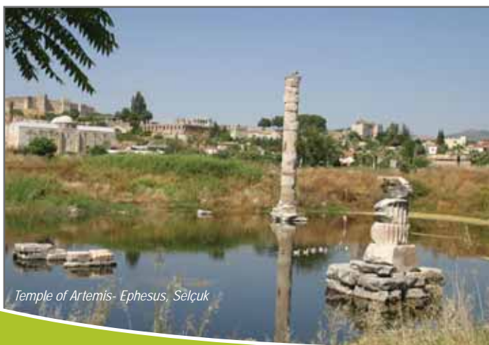
Temple of Artemis- Ephesus, Sêlçuk

The Temple of Artemis, dedicated to the Mother Goddess of Anatolia, was built in the Ancient Period by the Architects; Chersiphron, Metagenes from Crete and Theodoros. It was used not only for worshipping and for protection from evil, but throughout the centuries was used as a storage