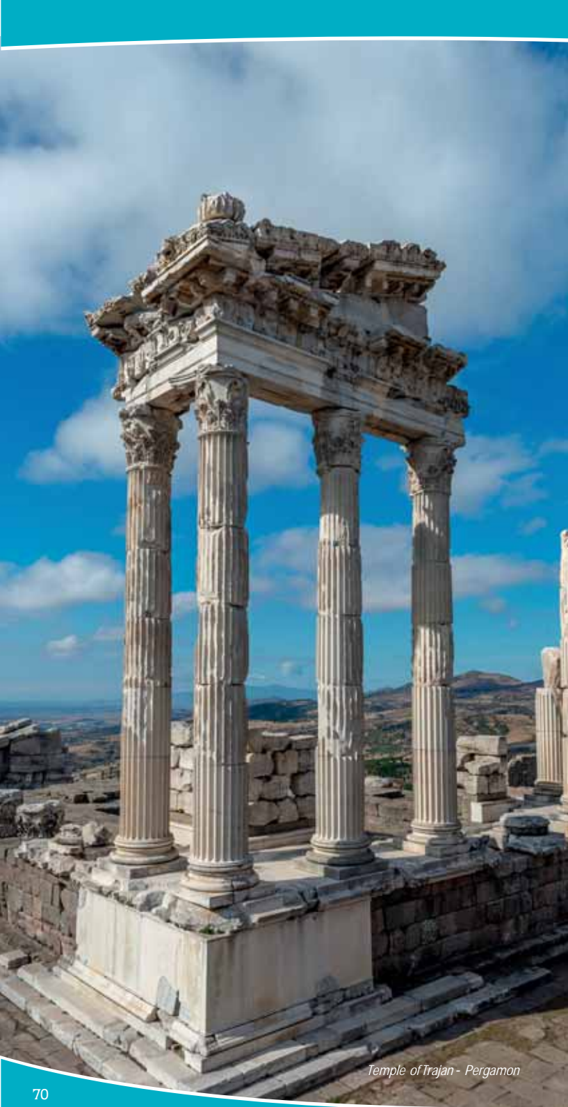
Temple of Trajan - Pergamon