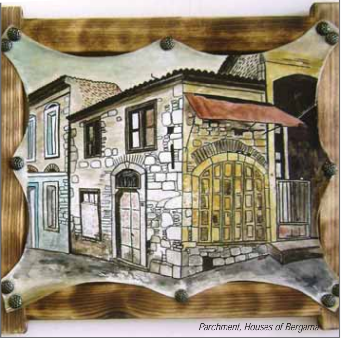
Parchment, Houses of Bergama