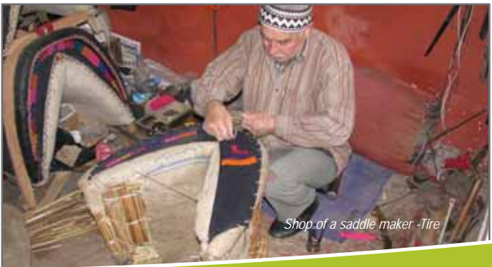
Shop of a saddle maker -Tire

80 km. from İzmir and 40 km. from Selçuk, Tire is one of the most popular sites in the Aegean Region, particularly for its cultural and natural assets. It is a tourist's