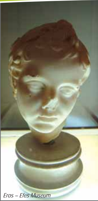
Eros – Efes Museum

types of copperware and beads produced to avert the evil eye (göz boncuğu). Visitors can also see a 16th century Ottoman Bath, which has been recently restored.