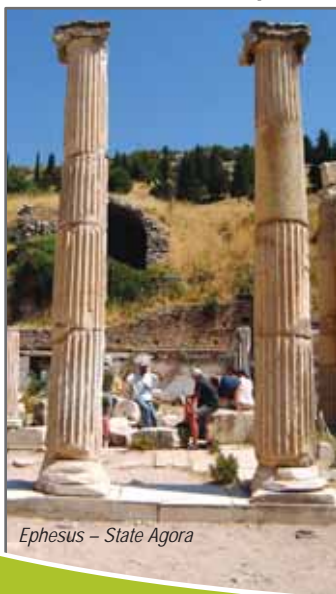
Ephesus – State Agora

The Asian Consul, Julius Aguilu in memory of his father, Celsus, built the Celsus Library situated near the commercial agora in 115. The library was the third largest in the world in the Classical Period after the Alexandria Library in Egypt, and the Pergamon (Bergama) Library in Anatolia. A door on the rear wall provides access to Celsus' tomb. The statue of Celsus, originally erected there, is now exhibited in the İstanbul Archaeological Museum. The decoration on the front of the structure, reflecting all of the architectural features of the Roman Period, is cited as one of the most beautiful examples