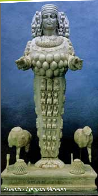
Artemis - Ephesus Museum

aqueducts; and civil architecture examples in Şirince Village. This locality, which was for centuries filled with the alluvium from the River of Küçük Menderes, is just 9 km. from the Bay of Pamucak, a preservation site with a crystal clear sea and a glittering beach.