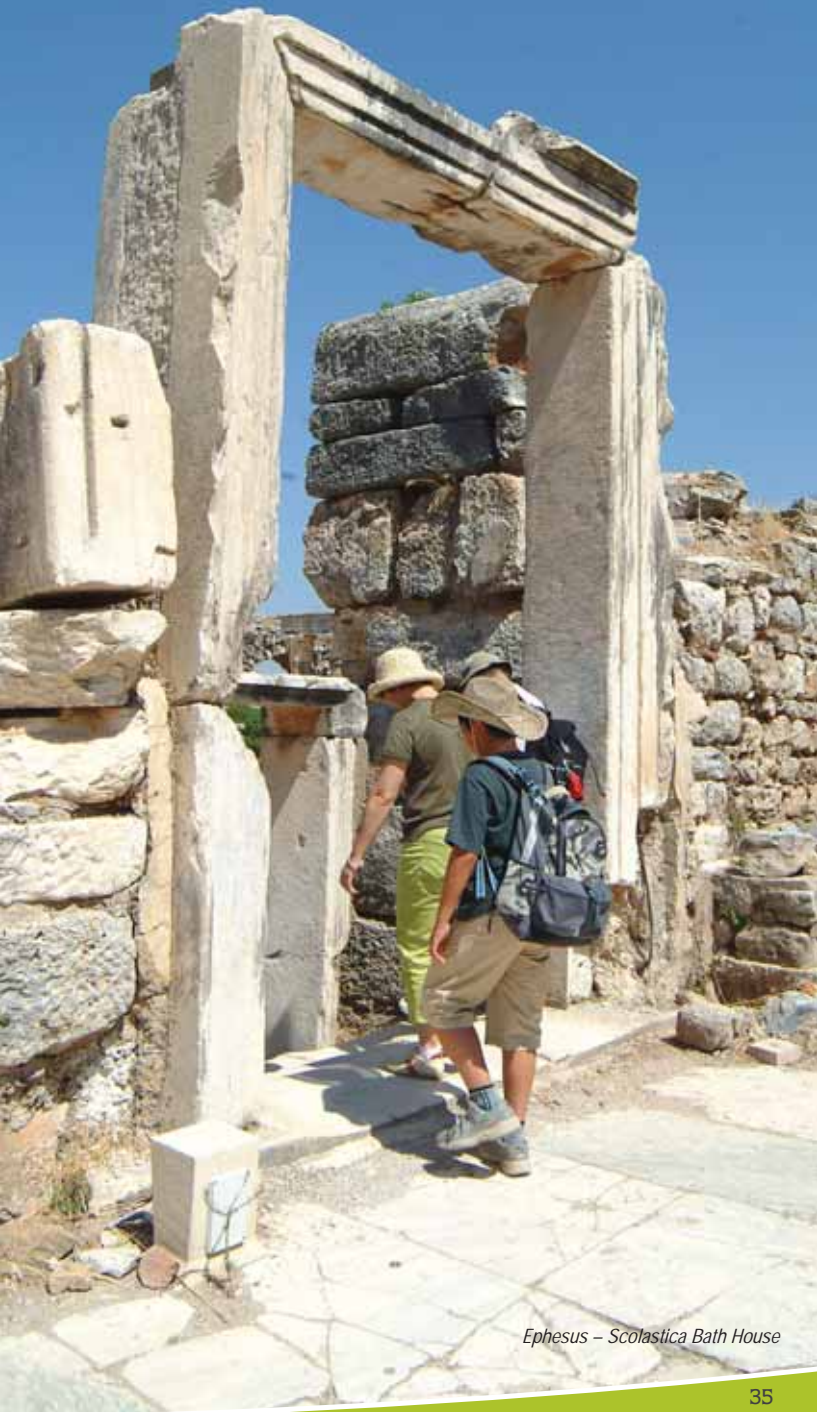
Ephesus – Scolastica Bath House